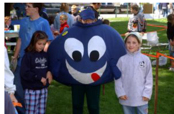
Newberry the Blueberry with friends